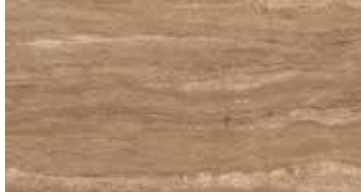
5536 Natural Mocha