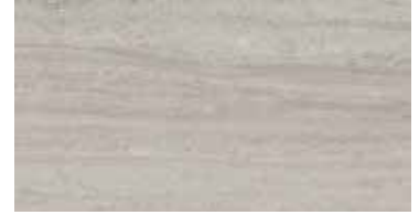
5538 Natural Graphite