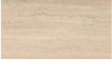
5535 Natural Mesa