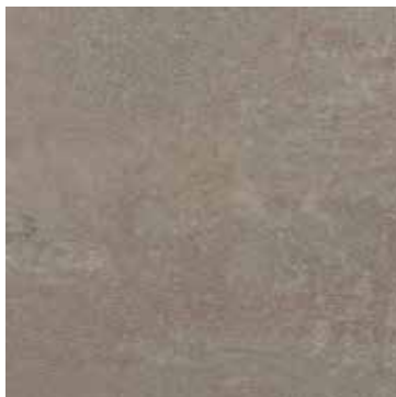
5522 Washed Concrete