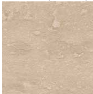
SF02 Sand Dune