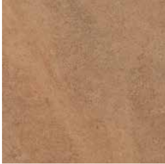
SS05 Coral Sand