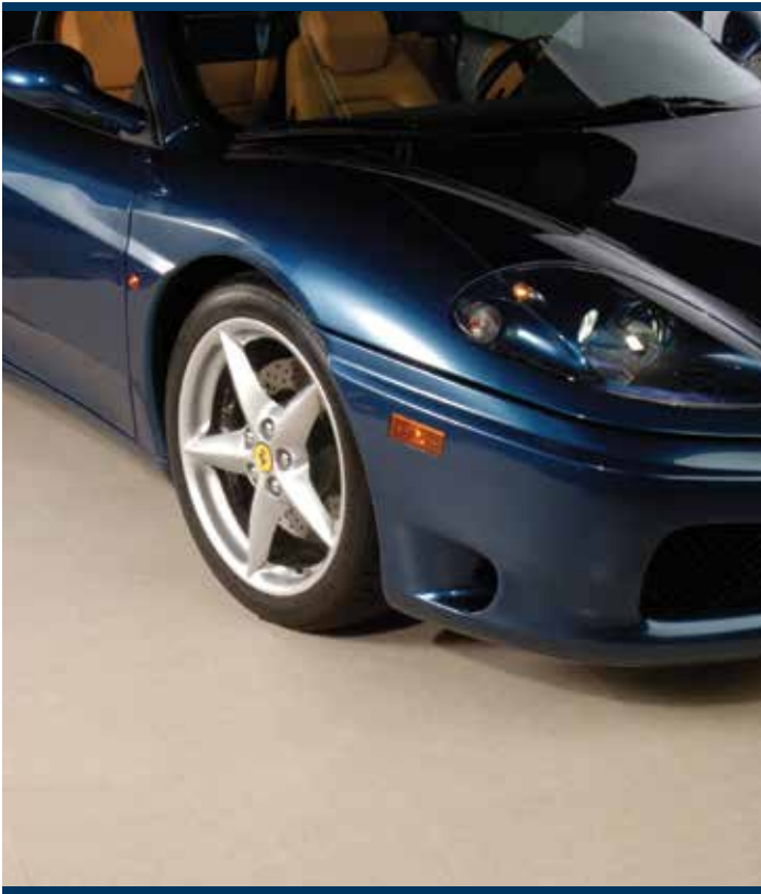
DP01 - Cream Diamante Palacio