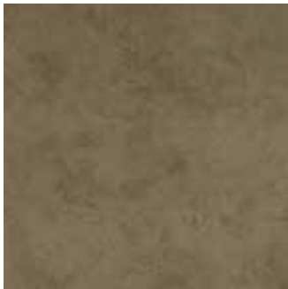
BT193 Bronze Beaten