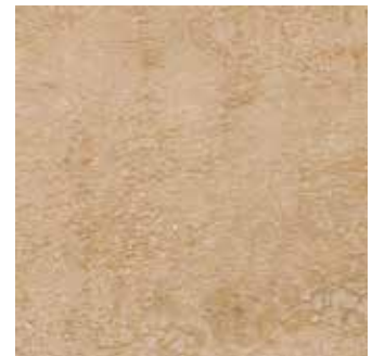
SF01 Canyon Pass