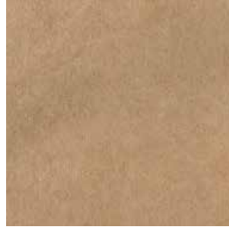
SS02 Sandy Shore