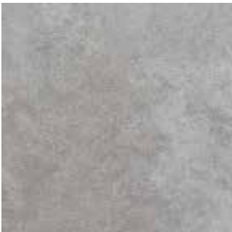
BT199 Silver Beaten