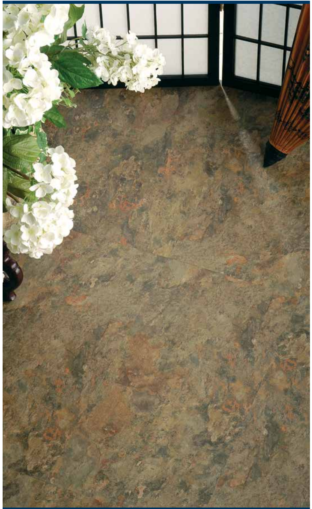
SL817 - Brown Slate