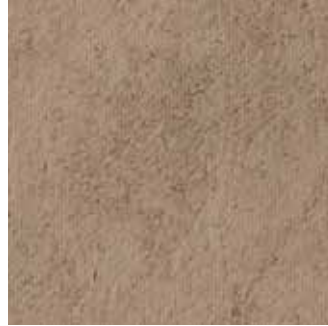
SS01 Wind Swept