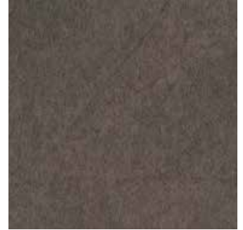
SS03 Black Sand