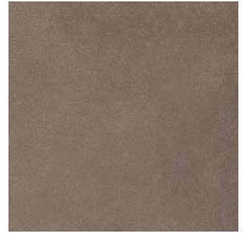
PZ07 Deep Taupe