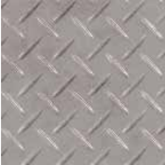
TD199 Silver Tread