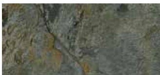
SL431 Dark Grey