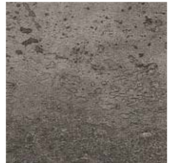
OP03 Silver Mine