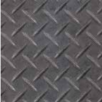
TD196 Pewter Tread