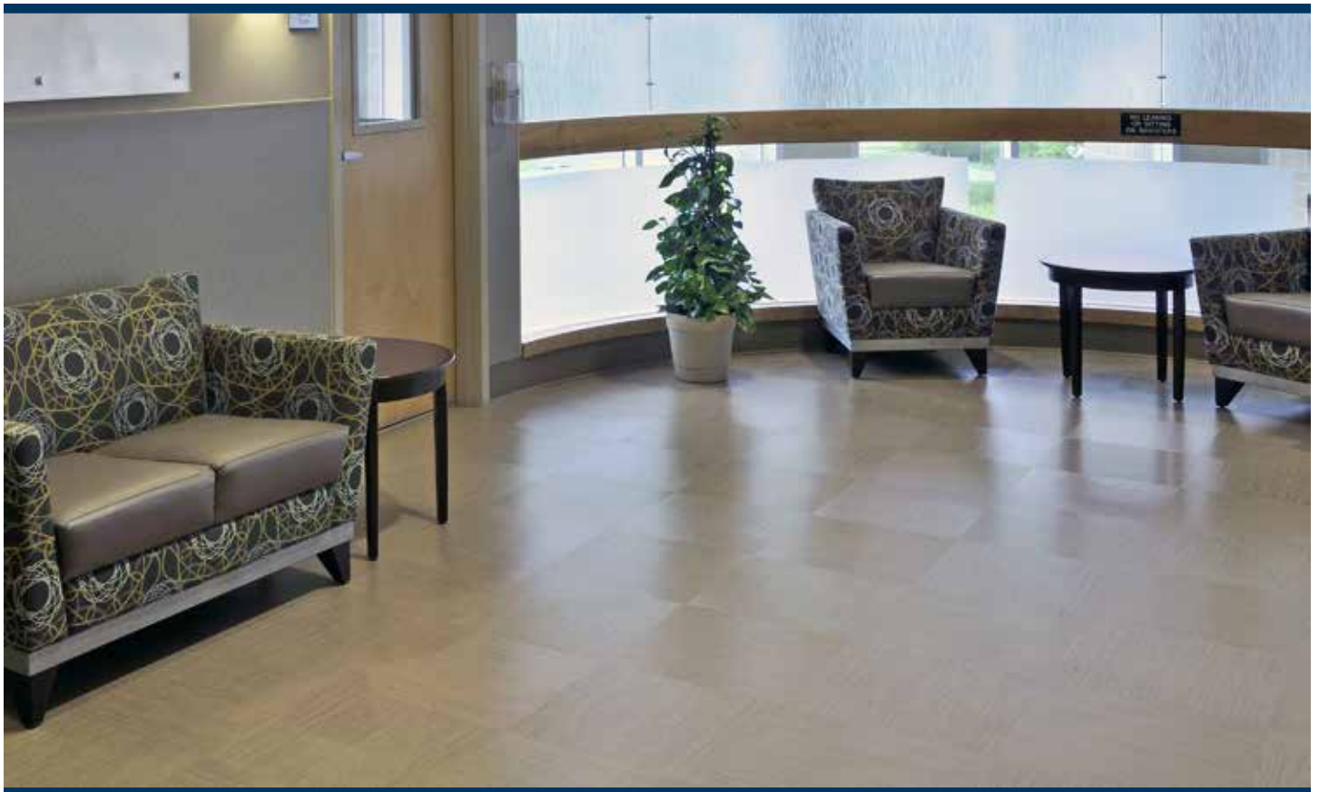
ST03 - Ivory Strings