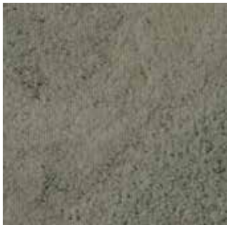
SS04 Sea Grass