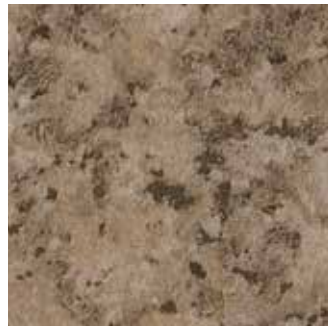
GR184 Gold Dust