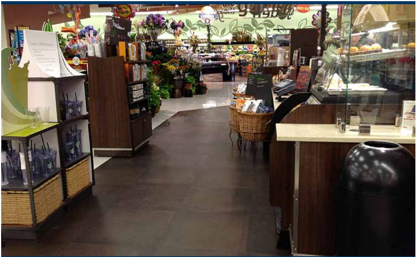
PZ08 Truffle Piazza