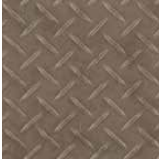
TD193 Bronze Tread