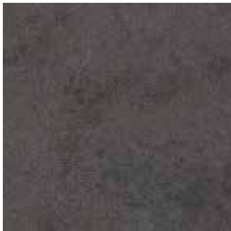
BT197 Cobalt Beaten