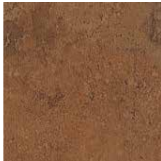
OP01 Bronze Age