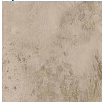
OP02 Oyster Shell