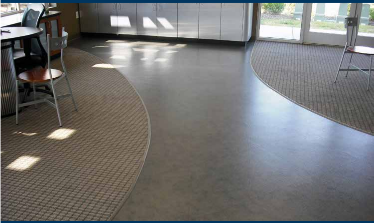
BT196 Pewter Beaten Metal