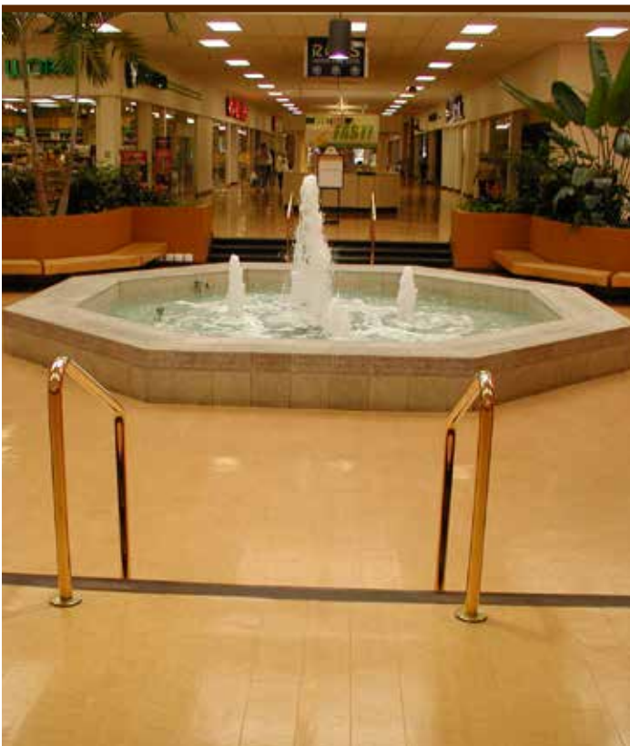
7850E Classic Maple