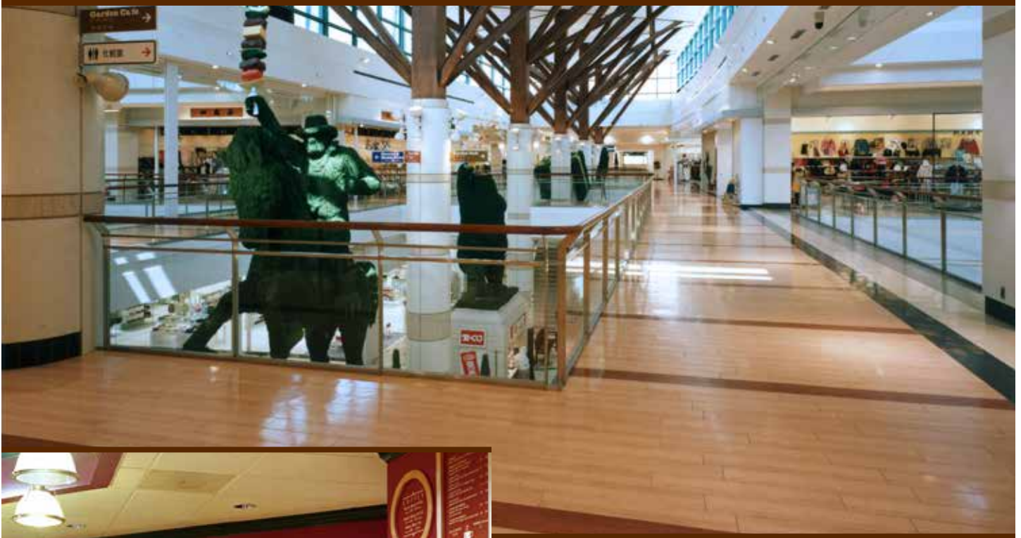
7262E Natural Maple