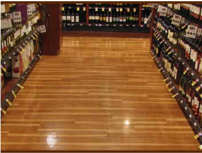
7871E Cedar Plank

Lightwood is available in a large selection of patterns and combines easily with other TOLI tile products for a limitless range of design possibilities.