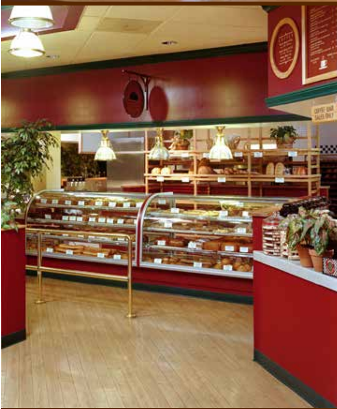
1022 Golden Oak